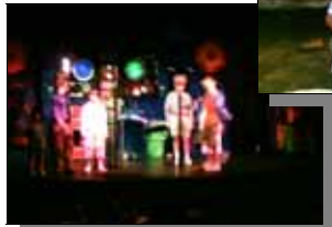
Phillip participating in the science show at Silver Dollar City.