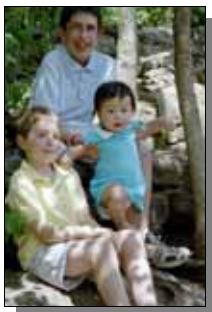
Three of the most wonderful MK's in the world!