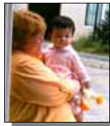
Hope and Mom sharing a special moment on "Gotcha Day"!