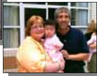
The first picture with Mom and Dad! This was taken just after we received Hope.