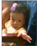
Enjoying the bus ride around China!