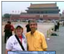
The Forbidden City in Beijing China. This was our first full day in China.