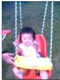
I LOVE YOU!