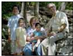
The Kovach family loves you!