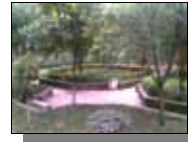
This is Autumn Moon Garden where Hope was abandoned at when she was just 9 days old. She was wrapped in a jacket.