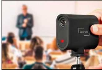
The Mevo Start Streaming Camera is easy to use and sends video and audio directly to the web. If you're interested, we have an Amazon list that you can use to order your setup.

Content: Make sure to greet your online audience from the pulpit and have someone reply to comments during services. If you are online only, try changing greetings, or order of service.