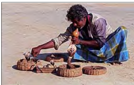
A Sri Lankan Gypsy snake charmer. Many gypsies engage in practices such as fortune telling and snake charming as part of their religion and to entertain tourists.*

Please be praying for the Gypsy peoples of Sri Lanka as these 40 pastors are trained to reach these nomadic people for Jesus!